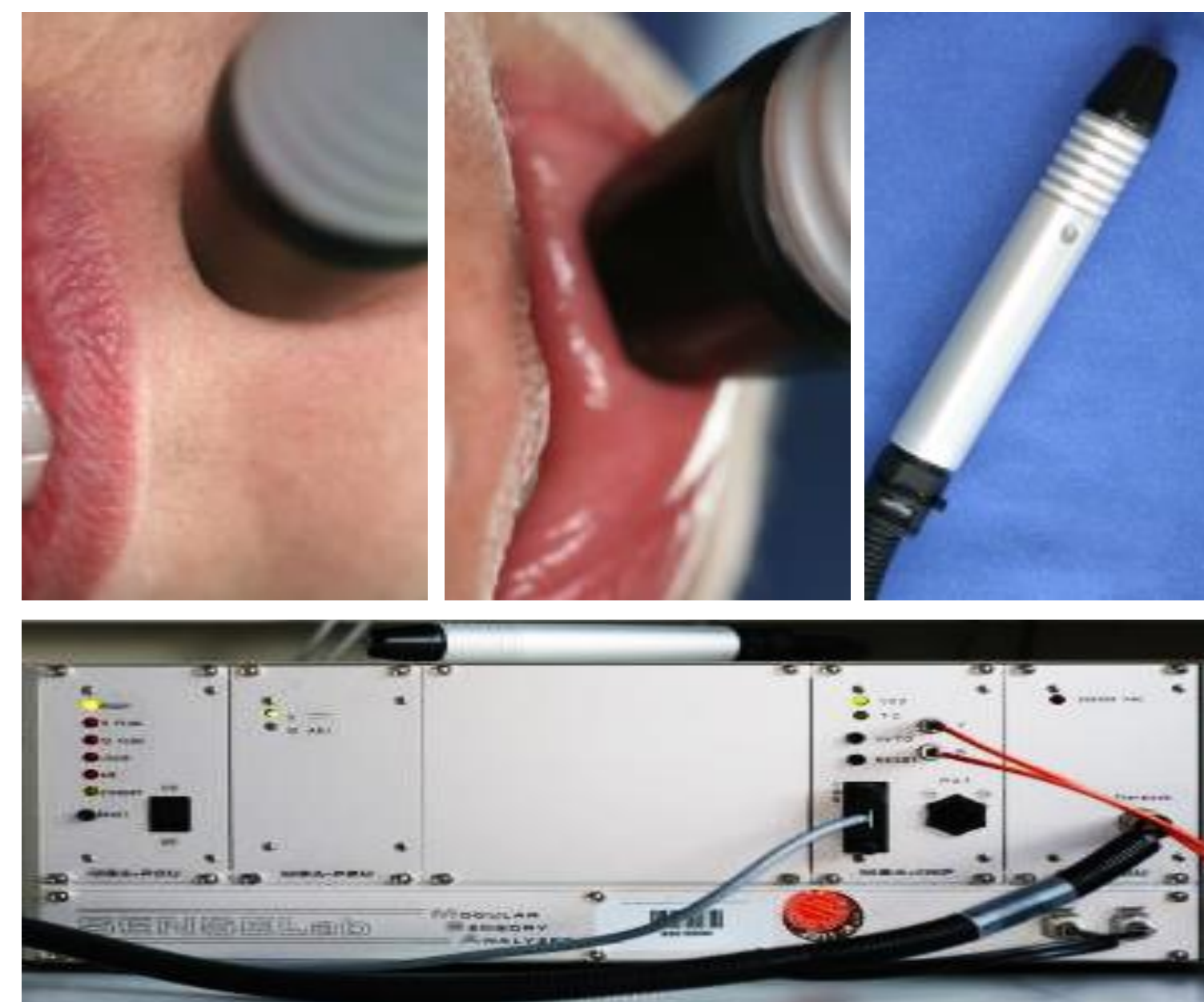
Figure 1: Quantitative Sensory Testing Thermal perception and pain thresholds

QST is a non-invasive, psychophysiological approach to detect thermal and mechanical perception and pain thresholds in neuropathic pain 2 . Thereby the function of large and small afferent nerve fibres will be considered, revealing hypaesthesia, dysaesthesia and hyperaesthesia. QST data were evaluated for healthy subjects (n=20) and patients suffering from painful trigeminal neuropathy (n=5) at chin and lip. In case of painful sensations, thermal and mechanical hyperalgesia, allodynia and the history of pain, as well as anxiety and depression (HADS-D) were monitored and evaluated.